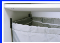
Nylon bag hooks makes bag fit tight. No paper misses the bag.