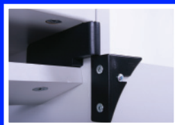
180 Degree nylon hinge for unobstructed collection